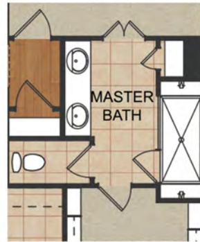
Optional Master Bath