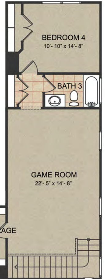
Second Floor w/ Bath 3 & Optional Bedroom 4

For more information, visit our website at BuffingtonHomesAR.com