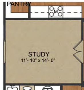
Optional Study 1