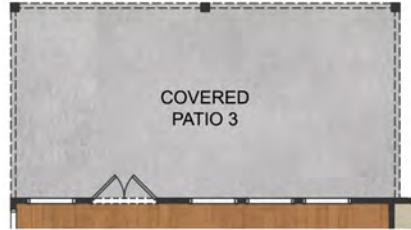
Optional Covered Patio 3