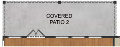
Optional Covered Patio 2